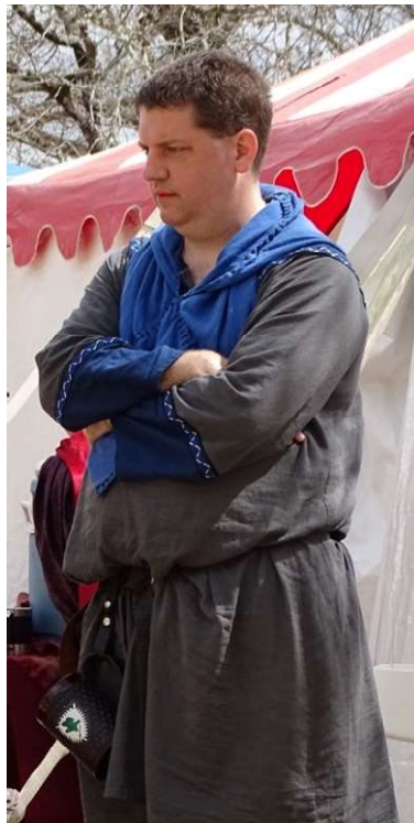
Figure 1- Photo courtesy of Greg Hall