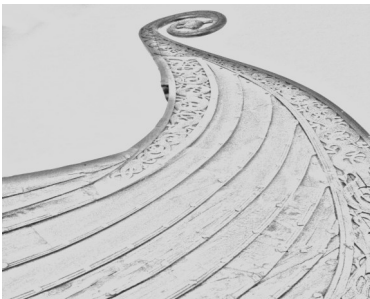
Personal picture taken by Scott Humphries, on view from the Oslo Viking Jökstad museum