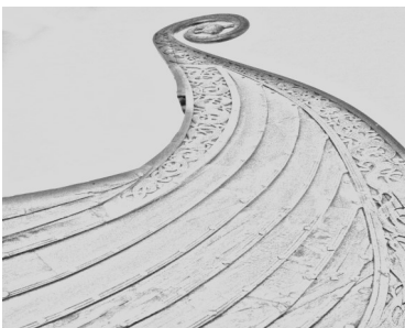
on view from the Olof Viking Jökstad museum