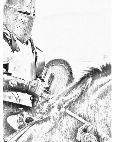
Historical information provided by www.historyorb.com